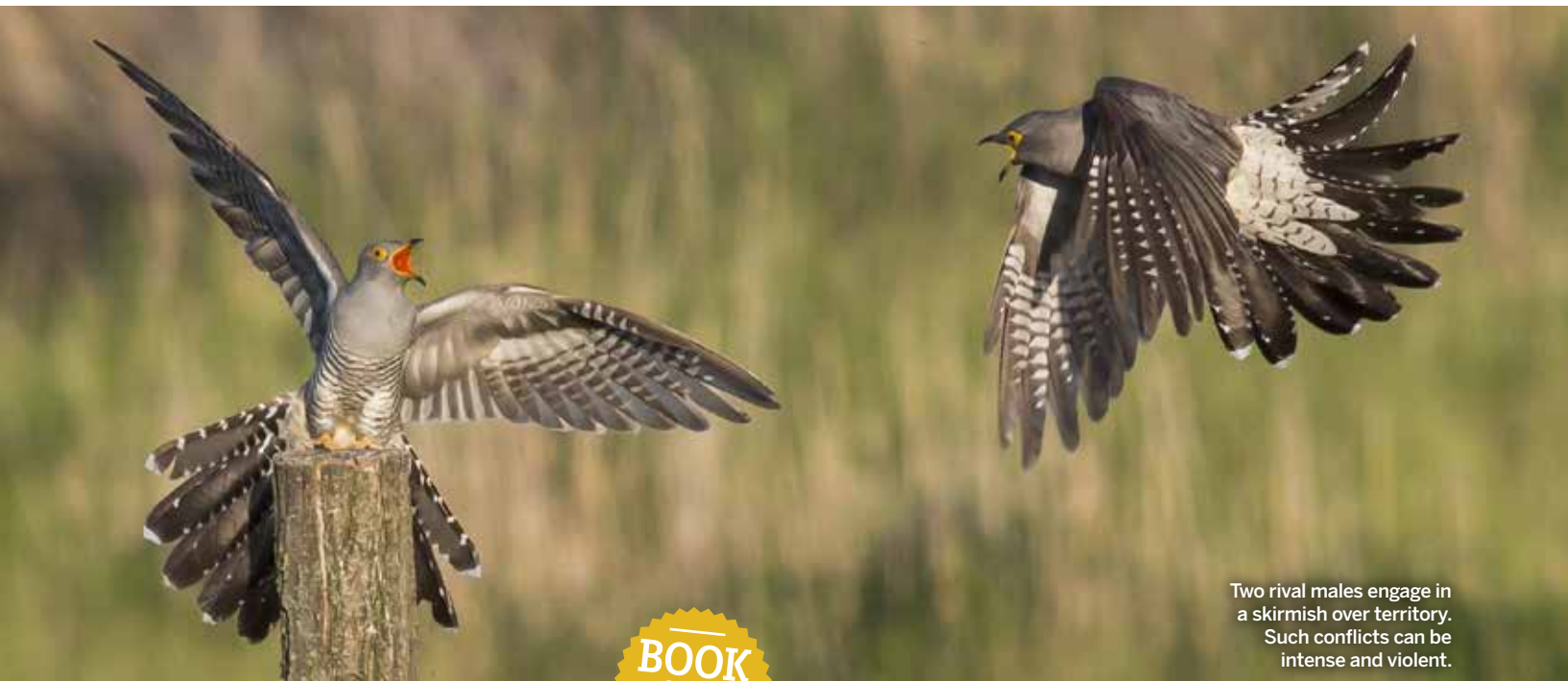
Two rival males engage in a skirmish over territory. Such conflicts can be intense and violent.