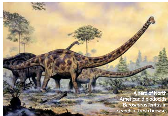
A herd of North American diplodocids Barosaurus lentus in search of fresh browse.